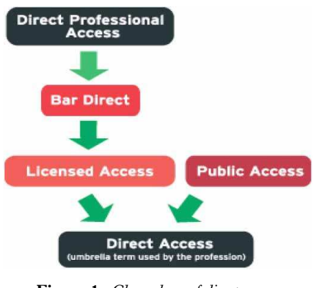
Figure 1. Chronology of direct access