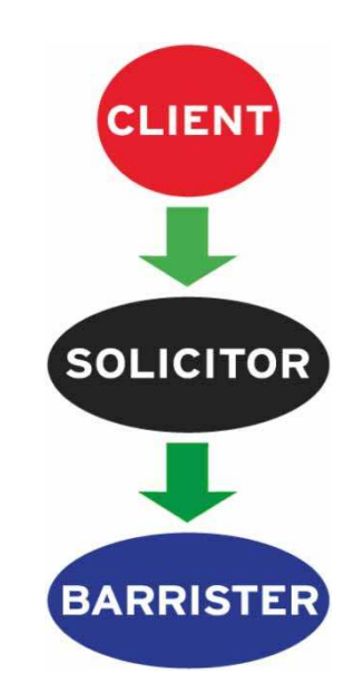
Figure 2. Traditional barrister-client relationship

The client (or lay client) seeks assistance from a solicitor who then instructs a barrister if particular kinds of expertise are required, especially advocacy. The primary relationship for the client is with the solicitor. The lack of directness for the client was often felt in court hearings where the barrister might be double-booked, owing to a trial and appeal conflicting for example. Clients were not permitted to reschedule their cases and therefore would have to hire another barrister at short notice.<sup>6</sup>